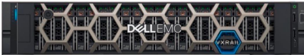
Figure 1 – VxRail Appliance

VxRail appliances are built to provide all mission-critical services for a SDDC, including virtualization, compute, and storage. Full integration with VMware’s vSphere, and Virtual SAN 1 (vSAN) provide the backbone of the appliance. The appliances are deployed in clusters ranging from 3 to 32 nodes. A node provides computation for the appliance and contains multiple processors. With the exception of the E Series appliances, each appliance is a 2U 2 form factor supporting either one node (the V, P, and S Series) or up to four nodes (the G Series). The E Series is a 1U form factor supporting one node. A single E, G, V, P, or S Series appliance can support up to 200 virtual machines (VMs). VxRail’s hyper-converged infrastructure provides customer VMs with the power of an entire SAN in a single appliance.